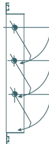
Internal Wall mounted